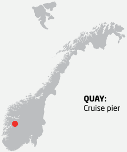
QUAY: Cruise pier

Type of bottom: Sand Minimum depth: 40 m Distance from anchorage to tender pier: 300 - 400 m