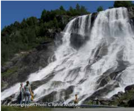
Furebergfossen.