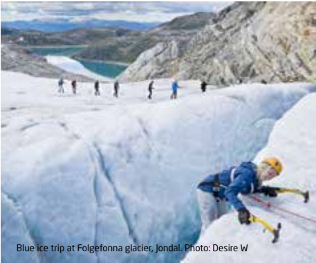
Blue ice trip at Folgefonna glacier, Jondal.

Duration: Individual Capacity: Unlimited By the fjord in Jondal centre, just a few metres from the port, you can wander the streets to see the Swiss style houses, dating from the 1800s and 1900s. There are gravel paths from where you can see the grand flagstone or slate roofs, the unique "lace" decorations under the eaves, and the distinctive windows, characteristic of this style. In the village centre, you will also find beaches, grocery stores, and at the house called "Juklafjord" with tourist information, exhibition about the Folgefonna National Park, a Centre for glacier hikes, hire bikes, sea kayak and GPS-devices that are programmed with the local hiking possibilities.