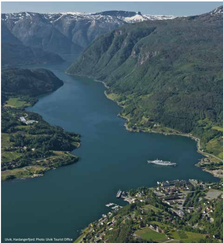
Ulvik, Hardangerfjord.