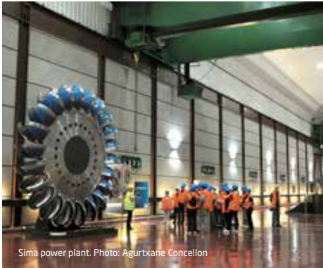
Sima power plant.

Duration: 1 hour Distance: 250 m from the port Capacity: 50 The brand new "Mosstovo" cafeteria, located next to the Vik Pensjonat (B&B) in the centre of Eidfjord, is built in local, old and authentic building style. There is sale of local food from Hardanger for both cup and platter.