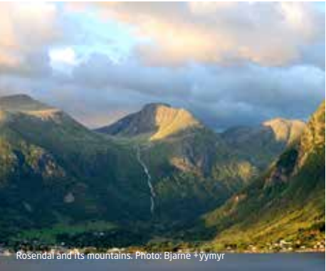
Rosendal and its mountains.

Duration: from 2-6 hrs (depending on activity), Capacity: Unlimited (subject to bus availability). From the dock, you can go by bus or car to the glacier, through 19 km of magnificent and breath-taking landscape. There is free parking at Fonna Glacier Ski Resort, where you can ski in the middle of summer, or