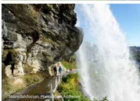
Steinsdalsfossen.